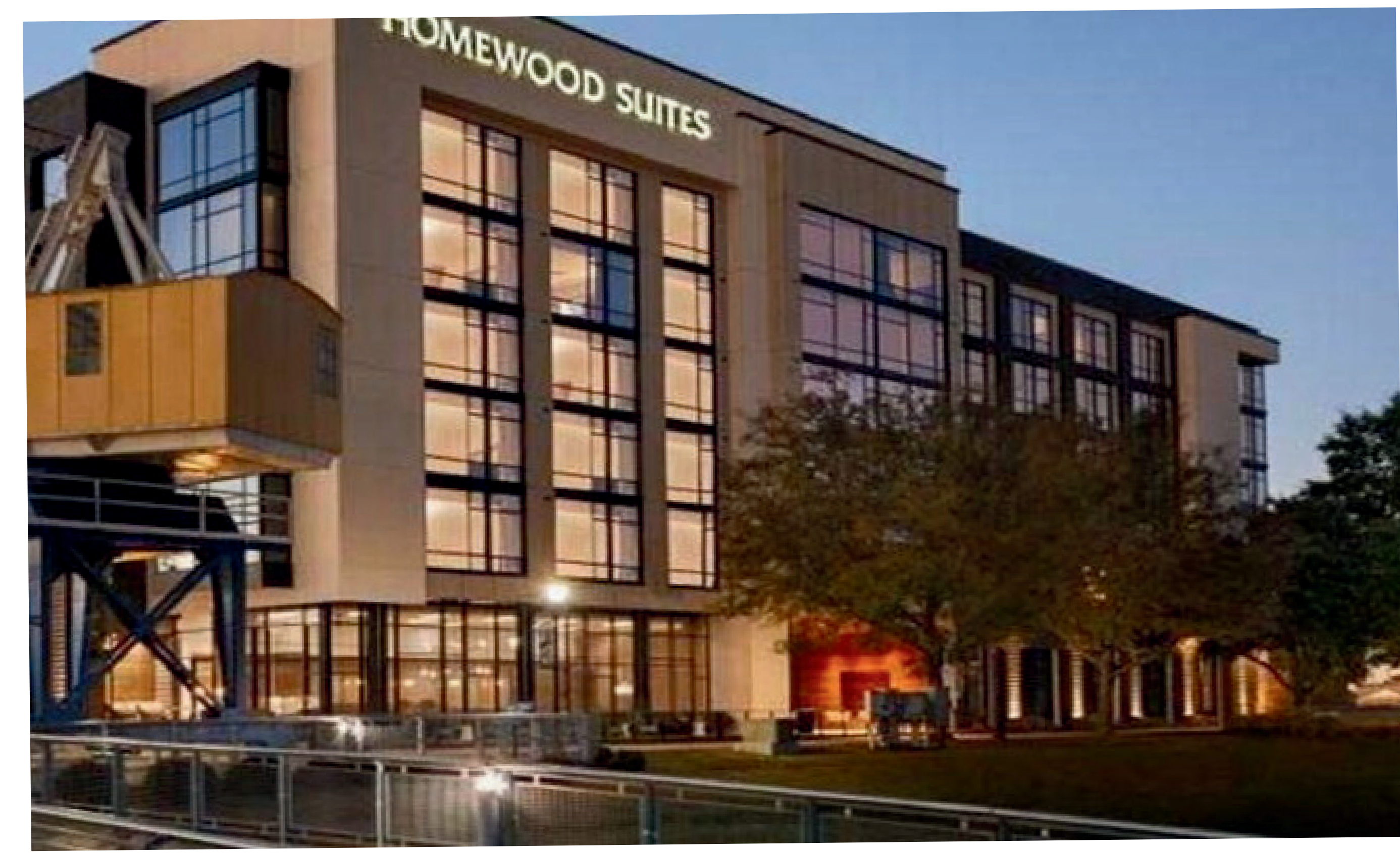
After Christina Riverfront Hotel

EXAMPLE OF A BROWNFIELD REDEVELOPMENT FROM DELAWARE